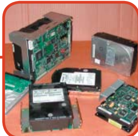
Standard Hard Drives