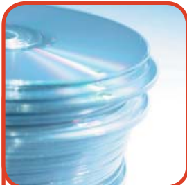
CDs & DVDs

Komar's DMD Data Destroyer is ideally suited for the destruction of all types of digital media including hard drives, cell phones, PDAs, back up tapes, CDs, DVDs, and most any media containing confidential information. Units can be loaded onto or mounted in trucks for mobility. Komar Industries has been building volume reduction equipment for over 33 years. Our engineering experts will help you determine the right shredder for your digital media application.