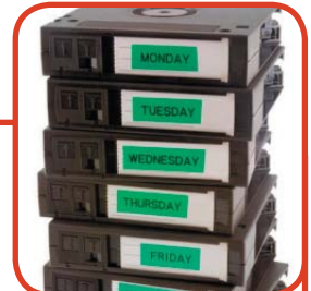
Back Up Tapes