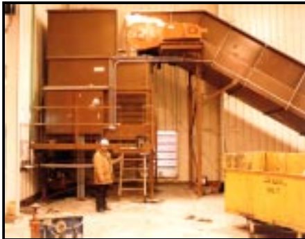
Automotive plant transfer system