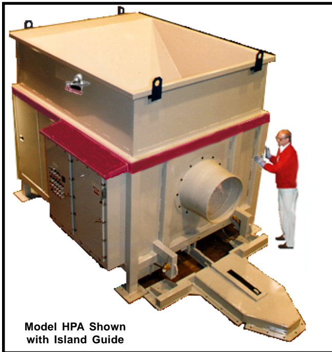
Model HPA Shown with Island Guide