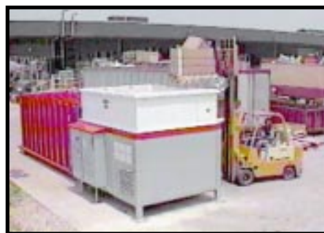
HPA-7 Operating at Heavy Industrial Facility

The KOMAR Herculean I combines shredding and compaction in one highly efficient heavy-duty machine for reduction of difficult waste found in heavy industrial, municipal, construction and demolition operations. With a highly efficient hydrostatic driven screw auger, the Herculean I maintains a continuous feed without interruption for compacting into a 40 cubic yard container or transfer trailer.