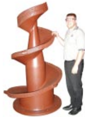
Easy to maintain screw auger

Komar custom engineers, manufactures, installs, and services complete waste processing systems for virtually all types of solid, semi-solid, hazardous, and non-hazardous materials and waste streams.